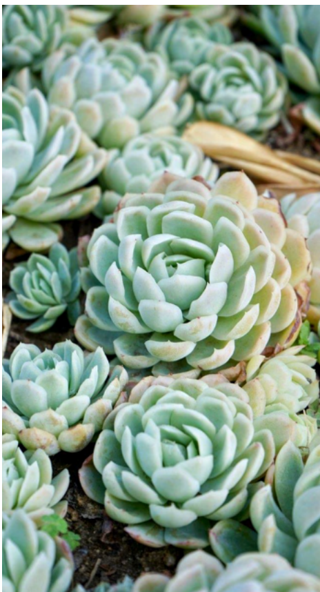
Echeveria elegans (Crassulaceae)

For July the selected cactus variety is Rebutia and succulent, Echeveria! I know you have them, let's bring them in. And don't forget your dish gardens! Remember for the Mini Show presentation, it is a single plant (or a plant with its pups). Several plants of the same species will be a dish garden. A dish garden can be multiple plants of a single genus, or mixed genres! Since Rebutia generally grow in clumps, it will be hard to tell whether your example originates from a single plant, so we will have to be a little flexible on this one.