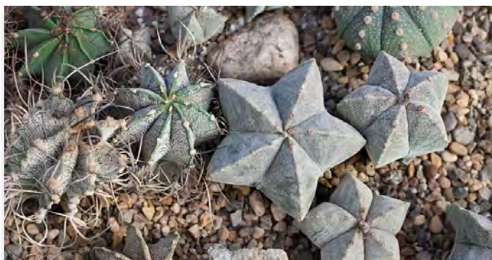
Astrophytum star cacti