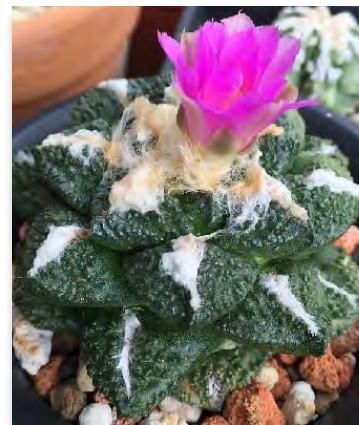
Ariocarpus- fissuratus cv. Godzilla