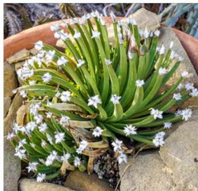
Agave albopilosa by Gerhard Bock