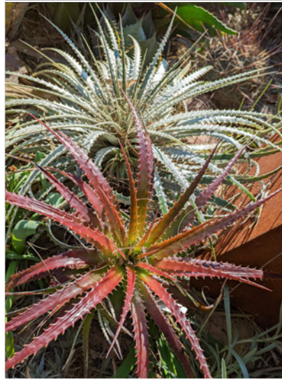
Top: Hechtia 'Silver Star' Bottom: Hechtia 'Oaxaca Sunset' by Gerhard Bock