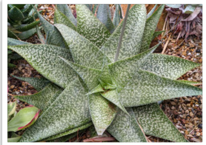
Aloe deltoideodonta 'Sparkler' by Gerhard Bock