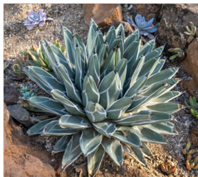
Agave nickelsiae by Gerhard Bock