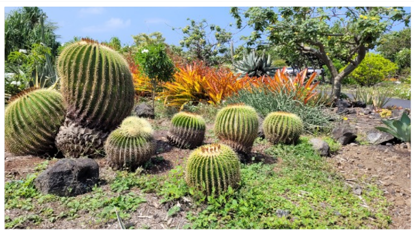
Cactus and Succulent Garden, Big Island of Hawaii

Where have you traveled in or out of the country to see plants in habitat? Sadly, I have not done this type of trip. The closest is the Big Island of Hawaii which has a fabulous cactus and succulent garden by their old airport, mostly cared for on a volunteer basis. If you are ever on the Big Island, it is a must see.