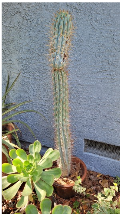
Browningia hertlingiana "Blue Cereus"

Are you mostly a cactus or succulent person? I was basically a succulent person when I first started getting into this hobby, but after joining SCSS I began to collect some cactus and