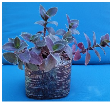
White velvet, a species of Spiderwort

Where do you purchase new plants? Lots of places. SCSS meetings are always a great source. Sometimes Home Depot, Secret Garden, Green Acres and even Grocery Outlet!