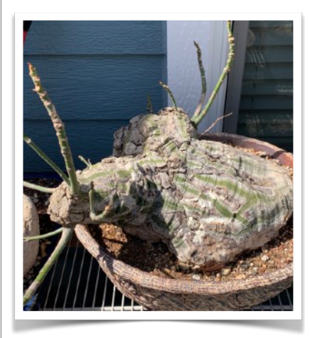
Bombax ellipticum

I live in Rocklin and don't have a greenhouse. My front yard is a succulent/cactus garden. The back yard is a chaotic jumble of potted plants.