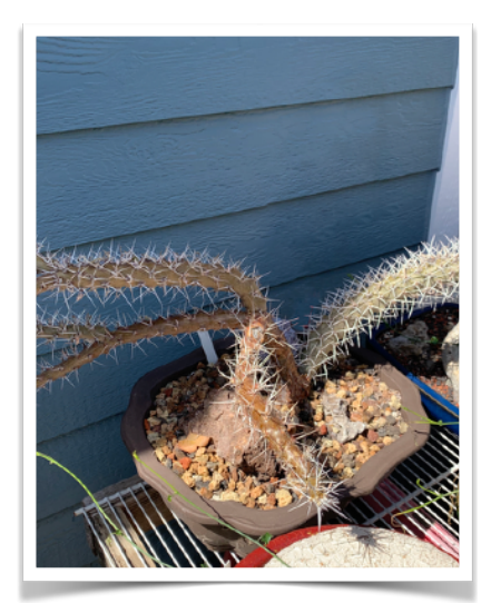
Didiera trollii

I've been collecting cacti and succulents for the past 45 years. I started out collecting mostly cacti and have gradually shifted to mostly succulents.