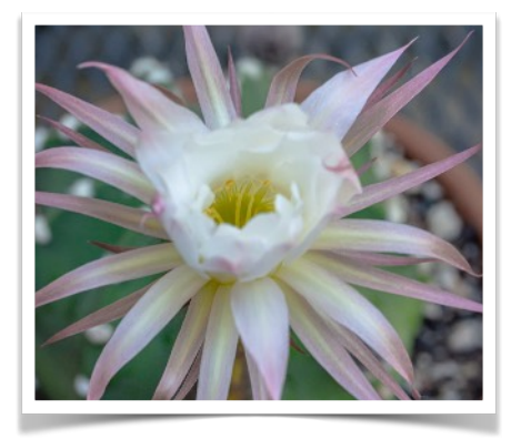
Echinopsis ancistrophora