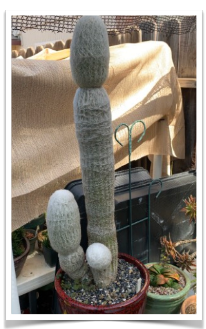
Espostoa lanata by Steve Goodman

I like Euphorbia because of all the various types and looks that are available. From plants that resemble cacti to bushes to plants with extensive underground caudices; the variations are endless.