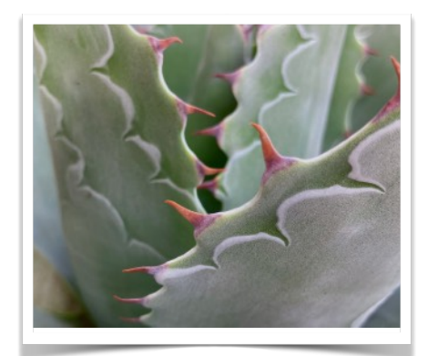
Agave parassana