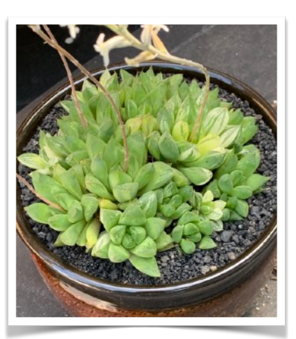
Haworthia cymbiformis

My favorite spots for shopping are Poot's nursery in Ripon and