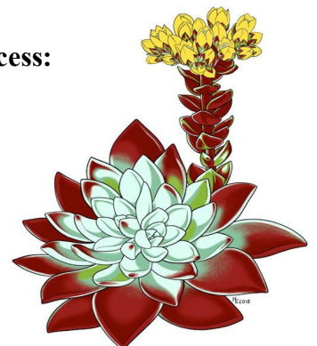
CSSA 38th Biennial Convention July 17-20, 2019 San Luis Obispo, CA

CSSA Conventions alternate between California venues and suitable venues in other states.