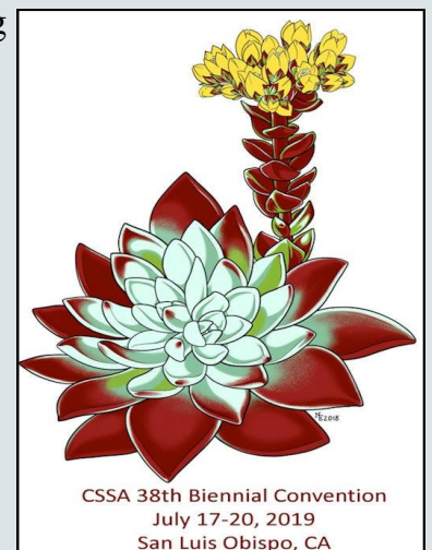
CSSA 38th Biennial Convention July 17-20, 2019 San Luis Obispo, CA