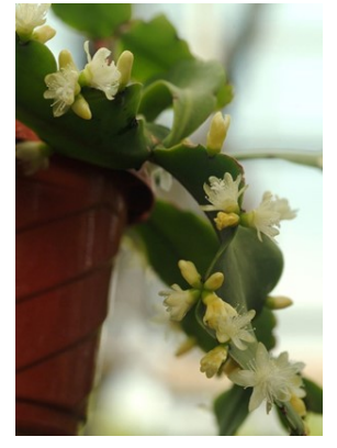
Rhipsalis crispate in flower

Geranium is a genus of 422 species of flowering annual, biennial, and perennial plants that some of the most common and popular garden plants. They are found throughout the temperate regions of the world and the mountains of the tropics, but mostly in the eastern Mediterranean. The flowers have five petals and are colored white, pink, purple or blue. Geraniums will grow in any soil as long as it is not waterlogged. They can be propagated with cuttings in summer, by seed, or by division in autumn or spring.