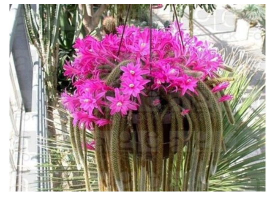
Mexican Rat Tail

Aporocactus falgelliformis, or Mexican Rat tail cactus, is native to Mexico. It is a trailing plant that sends out long stems with short, fine spines. The stems are green overall when young and change to beige as they age. Flowers are rare, but when they arrive, they are a glorious bright pink or magenta to red hue. Blooms are up to three inches long and tubeshaped and bloom on mature stems.