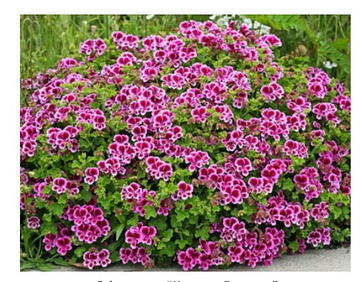
Pelargonium "Veronica Contreras"

We are including both Pelargoniums and Geraniums in our March mini show. Pelargonium is a genus of flowering plants including about 200 perennials, succulents, and shrubs species, which are also commonly known as geraniums . Both genera belong to the Geraniaceae family that originally included all the species in one genus, Geranium . They were later separated into two genera in 1789. Pelargonium species are evergreen perennials indigenous to temperate and tropical regions of the world with most Southern African species. Often grown as popular bedding plants like Geraniums , they are drought and heat tolerant but can tolerate only minor frosts. The shape of the flowers offers one way of distinguishing between Geranium and Pelargonium .