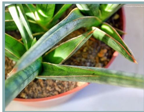
Sanseveria suffruticosa | Photo by Gerhard Bock

There are about 70 species, which are native to Africa, Madagascar and southern Asia. There are multiple varieties, which include a dwarf type of Snake plant known as "Birdsnest Sanseveria" ( Sanseveria trifasciata 'Hahnii'), which is low growing and has a rosette form of growth. The leaves of other African species are used in the production of fiber for making rope. S. chorenbergii sap has antiseptic qualities and is used in first aid for bandages. Sanseveria are also used for air purification in rooms since they are able to absorb carbon dioxide and release oxygen at night. Sanseveria have lovely sturdy foliage and make excellent houseplants. They can tolerate some low light but prefer bright light. They can go long periods of time with little or no watering. Propagation is done by clippings or separating the rhizomes that are produced at the base of the plant.