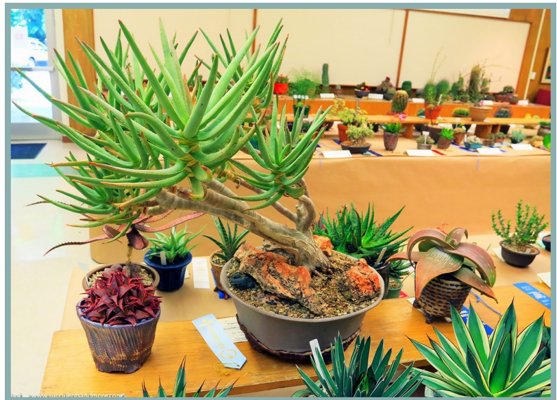
Aloe ramosissima