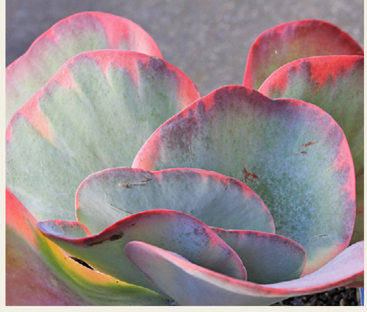
Kalanchoe luciae 'Fantastic'

and 8 stamens. They should be planted in well drained soil and care should be taken to avoid searing afternoon sun. A number of species can take temperatures close to freezing for short times, but none will really tolerate any frost. The species that have pubescent (fuzzy) leaves can generally tolerate Phoenix-type intense heat without trouble particularly if kept in light shade. The species with smooth leaves are a little less tolerant, but fare generally better than most other Crassulaceae in such hot conditions. In general, Kalanchoe do better with bright shade, although some species are comfortable with some direct sun, while others tolerate shade.