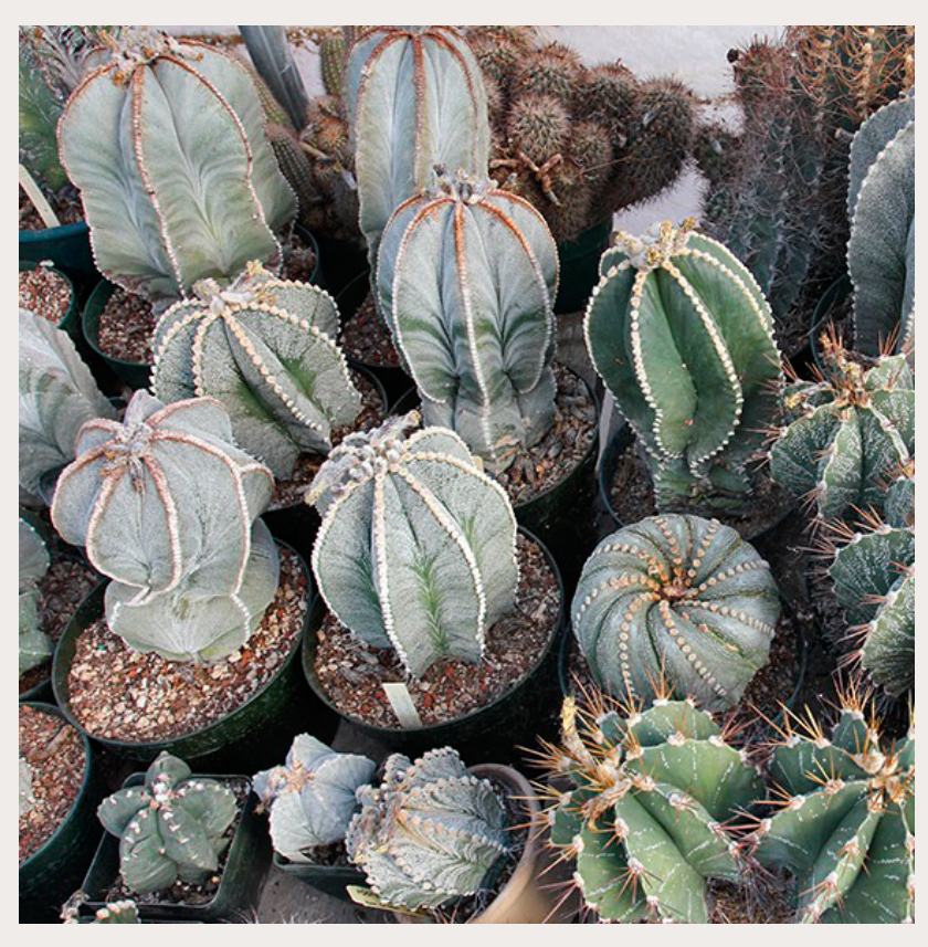
Different species of star cactus (Astrophytum sp.)

of flocking of white trichomes (or bumps) on the epidermis, although in cultivation some forms are bred for their lack of flocking. Plants in this genus also all have yellow flowers with fuzzy floral tubes. Some have a red-centered flower, all are radially symmetric and eventually turn into dry, fuzzy seed pods bearing relatively large, black seeds that are among the easiest to germinate. The four original Astrophytum members have been extremely popular in cultivation and numerous exotic hybrids have been created that accentuate various features such as amount of flocking, number of ribs, lack of spines, etc. With the uniqueness of Astrophytum caput-madusae coupled with its late discovery, it is currently one of the most sought after cactus species by collectors world-wide. And in that sense, it fits in quite well with the other Astrophytum species. Astrophytum is a Chihuahuan desert native occurring in north/central Mexico and southern Texas.