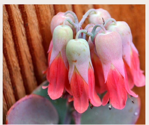
Kalanchoe marnieriana flowers

carpels, and 8 stamens. They should be planted in well drained soil and care should be taken to avoid searing afternoon sun. A number of species can take temperatures close to freezing for short times, but none will really tolerate any frost. The species that have pubescent (fuzzy) leaves can generally tolerate Phoenix-type intense heat without trouble particularly if kept in light shade. The species with smooth leaves are a little less tolerant, but fare generally better than most other Crassulaceae in such hot conditions. In general, Kalanchoe do better with bright shade, although some species are comfortable with some direct sun, while others tolerate shade.