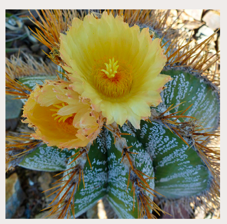
Astrophytum ornatum, or star cactus, from central Mexico

The genus Astrophytum is comprised of 4 species of globose to short cylindrical cacti and one sprawling, octopus-like member. The first four were discovered between the years 1828 and 1845. Two of these are spineless and two have prominent spines. While each species is quite distinct they all feature a star-shaped appearance when viewed from above. Hence the name Astrophytum, which means star plant. Astrophytum species have been frequently compared to marine life, in particular Astrophytum asterias for its striking similarity to sea urchins. The fifth member of this group was newly discovered in 2001. Astrophytum caput-madusae is quite distinct from the other members of the genus and actually very distinct from all other cacti genera as well. Hence, many enthusiasts feel it should be part of its own genus and consider it to be the sole species in the genus Digitostigma. The name Digitostigma describes the long digit-like tubercles that grow something like an octopus. Despite the noticeable differences, all 5 species including caput-madusae feature a sort