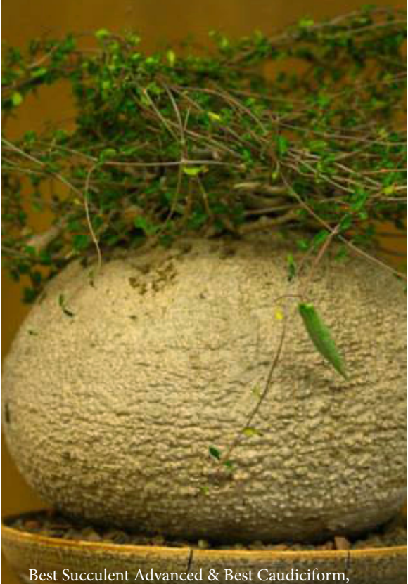
Fockea edulis