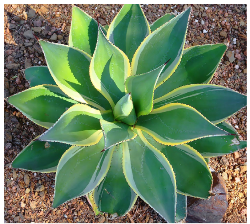
Agave Mitis 'multicolor'