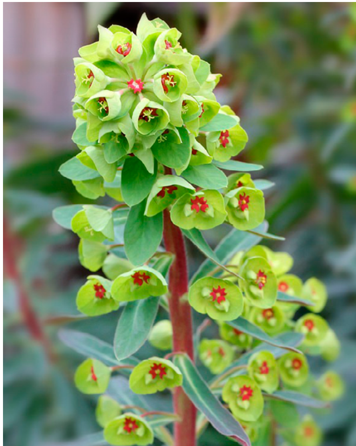
From Gerhard Bock's Blog: Euphorbia x martinii close-up. The chartreuse colored “petals” are actually bracts, not part of the flower. The true flowers are the tiny star-like structures you can see toward the top of this stalk.