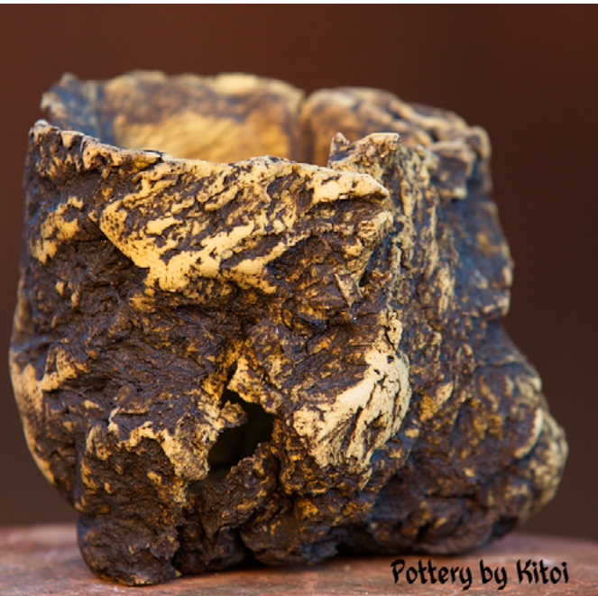
Pottery by Kitoi