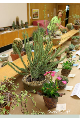
PENNY NEWELL - STAGING (Courtesy Candice Suter)