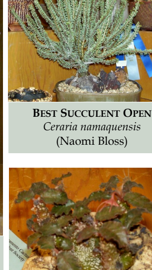
BEST MINIATURE SUCCULENT Dorstenia species (Penny Newell)