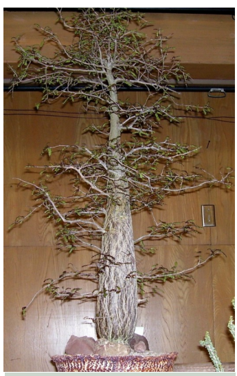
BEST MADAGASCAN SUCCULENT Operculicarya decaryi (Naomi Bloss)