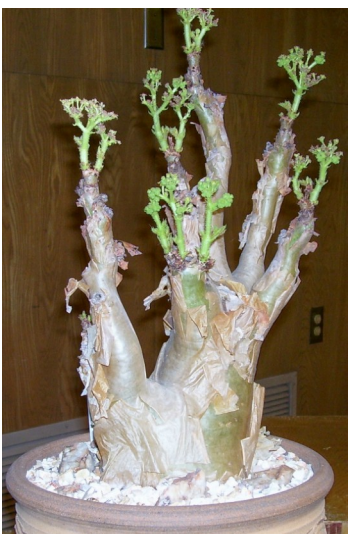
BEST SUCCULENT ADVANCED Cyphostemma uter