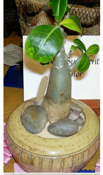
BEST SUCCULENT JUNIOR Adenium hybrid (JJ Dickey)