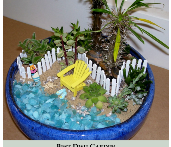
BEST DISH GARDEN "Cowabunga Dude – Surf's Up!" (Mara Aditajs