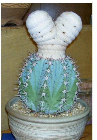
BEST CACTUS ADVANCED Melocactus glaucescens (Penny Newell)