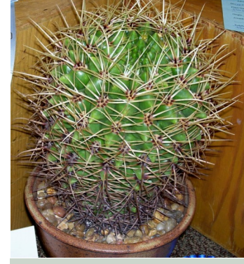
BEST GYMNOCALYCIUM Gymnocalycium monvillei (Marilynn Vilas)