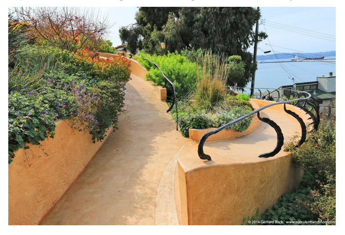
Leucadendron 'Jester'; stunning view of San Pablo Bay and the Richmond Bridge.

Have I said that I love the textured concrete walls and walks? They meander here and there, giving the impression that the garden is larger than it actually is.