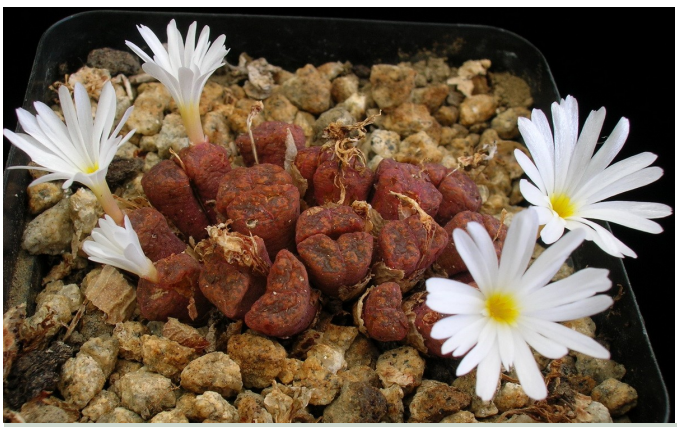
Conophytum pellucidum ssp.cupreatum