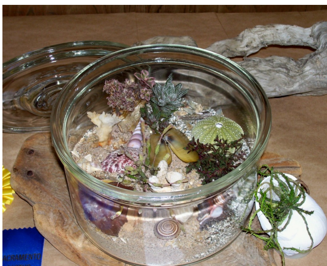
Best Dish Garden — 2012 "Seascape" (Marilynn Vilas)

DISH GARDEN is defined as the art of "miniaturizing" a garden of cacti and/or other succulent plants, staged proportionately, to create an imaginary natural landscape in one container with a theme.