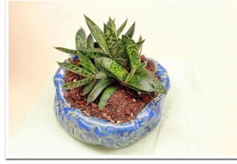
Gasteria liliputana