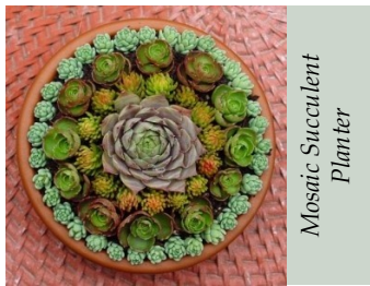
Mosaic Succulent Planter