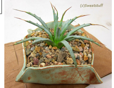
Agave utahensis

The main activity at the February meeting was to plant our newly finished pots. Members were asked to bring a special plant, potting soil, and top dressing. The plants I brought for my pots included a Euphorbia decaryi var. spirosticha I'd won at an SCSA raffle last year and a Dyckia fosteriana hybrid from last fall's Ruth Bancroft Garden plant sale .