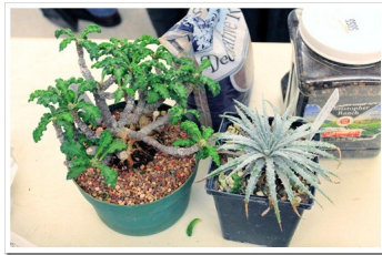
LEFT: Euphorbia decaryi var. spirosticha RIGHT: Dyckia fosteriana hybrid

The main activity at the February meeting was to plant our newly finished pots. Members were asked to bring a special plant, potting soil, and top dressing. The plants I brought for my pots included a Euphorbia decaryi var. spirosticha I'd won at an SCSA raffle last year and a Dyckia fosteriana hybrid from last fall's Ruth Bancroft Garden plant sale .