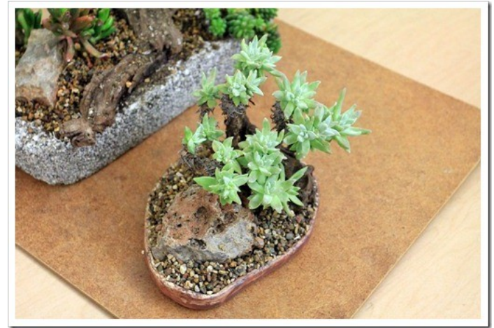
Unidentified Dudleya species in a very shallow dish