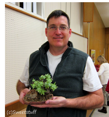
Many happy members adding a plant to their special pot!