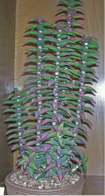
BEST IN SHOW & BEST ALOE Aloe pearsonii Penny Newell

Over 450 species of Aloe have been described with diverse forms and sizes. The genus includes small grass-like herbs and stem less succulent rosettes a few inches tall to larger species with stout 60ft trunks, occupying the