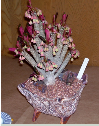
BEST EUPHORBIA Euphorbia millotii Penny Newell

◆ Attendance: Saturday - 750, Sunday - 713, TOTAL - 1463