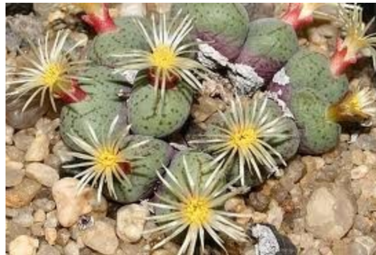
Conophytum uvaeforme (Stone plant)

Or maybe you're having problems with a plant and are unsure of how to care for it. This is the meeting to bring the plant to, and ask for HELP! There is such a wealth of knowledge in our Club, our members are plant lovers willing to share that knowledge and ideas with you. We'd like every member to bring in a plant this month!