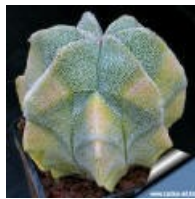
Astrophytum myrostigma forma variegata