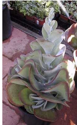
Kalanchoe thrysiflora (Paddle Plant)

Although Kalanchoe is a large genus of succulents and has a very wide distribution area: all of Africa south of the Sahara desert, Madagascar, islands of the Indian Ocean, India and Malaysia. Most of the species interesting to collectors are coming from Madagascar or South Africa.