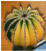
Uebelmannia pectinifera forma variegata