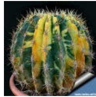
Ferocactus hystrix variegata