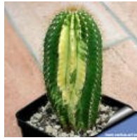
Neobuxbaumia polylopha forma variegata