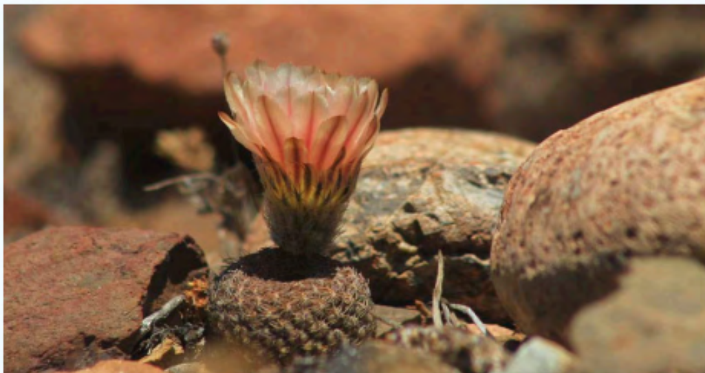
Erioseya napina subsp. lembckeii . A little cactus of Atacama Region that is a species in danger.