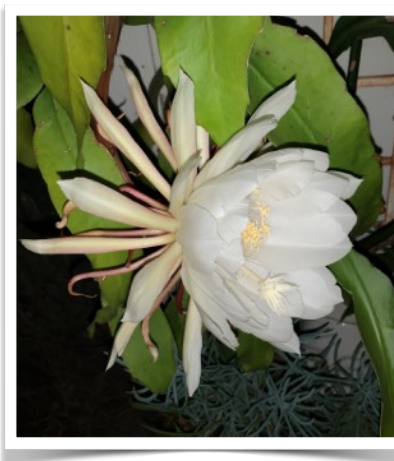
Epiphyllum oxypetalum Queen of the Night

Initially, I put them in pots because I could easily relocate a plant if it needed a different environment. With my growing plant collection, I needed more pots, so I decided to return to a previous hobby of ceramics and started making planters and pots.