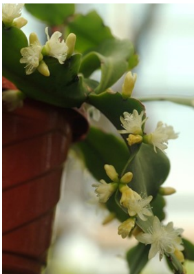
Rhipsalis crispate in flower

Geranium is a genus of 422 species of flowering annual, biennial, and perennial plants that some of the most common and popular garden plants. They are found throughout the temperate regions of the world and the mountains of the tropics, but mostly in the eastern Mediterranean. The flowers have five petals and are colored white, pink, purple or blue. Geraniums will grow in any soil as long as it is not waterlogged. They can be propagated with cuttings in summer, by seed, or by division in autumn or spring.