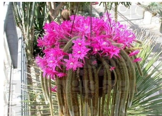
Mexican Rat Tail

Aporocactus falgelliformis , or Mexican Rat tail cactus, is native to Mexico. It is a trailing plant that sends out long stems with short, fine spines. The stems are green overall when young and change to beige as they age. Flowers are rare, but when they arrive, they are a glorious bright pink or magenta to red hue. Blooms are up to three inches long and tube-shaped and bloom on mature stems.