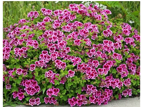
Pelargonium "Veronica Contreras"

We are including both Pelargoniums and Geraniums in our March mini show. Pelargonium is a genus of flowering plants including about 200 perennials, succulents, and shrubs species, which are also commonly known as geraniums . Both genera belong to the Geraniaceae family that originally included all the species in one genus, Geranium . They were later separated into two genera in 1789. Pelargonium species are evergreen perennials indigenous to temperate and tropical regions of the world with most Southern African species. Often grown as popular bedding plants like Geraniums , they are drought and heat tolerant but can tolerate only minor frosts. The shape of the flowers offers one way of distinguishing between Geranium and Pelargonium .