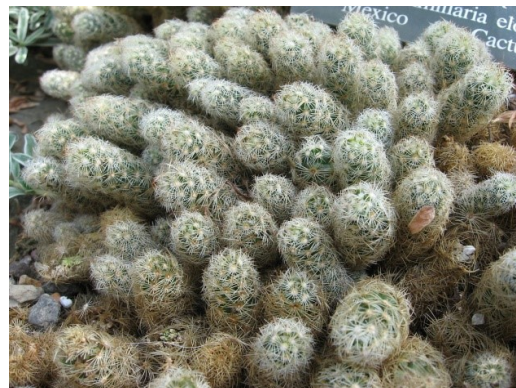
Mammillaria elongate , “Lady Finger” cactus