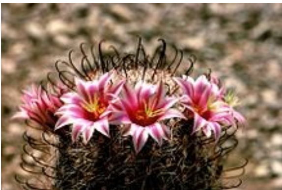
Example of a Mammillaria floral ring

The plants are usually globose and small although some species are elongated. They have stems from 1 cm to 20 cm in diameter and from 1 cm to 40 cm tall. Mammillaria have solitary to clumping forming mounds of up to 100 heads and with radial symmetry. Tubercles can be conical, cylindrical, pyramidal, or round with vibrant colorful flowers. The flowers are funnel-shaped and range from 7 mm to 40 mm or more in length and diameter; the flowers are colored white and greenish to yellow, pink, or red. The flowers often grow in a ring at the tubercle tip. Several species are threatened with extinction at least in the wild, due to habitat destruction and especially over-collecting for the pot plant trade.