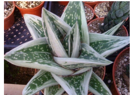
Gasteraloe “Green Ice”