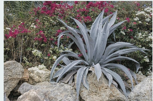
Powder blue A. americana