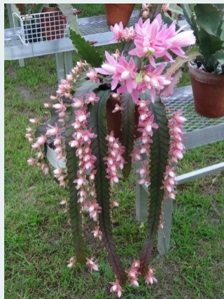
Epiphyllum German Empress hybrid