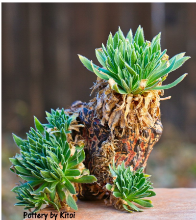
Pottery by Kitoi