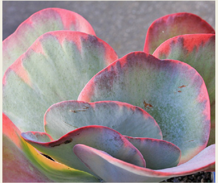
Kalanchoe luciae 'Fantastic'

Kalanchoe is a large genus of succulents in the family Crassulaceae and has a very wide distribution area: all of Africa south of the Sahara desert, Madagascar, islands of the Indian Ocean, India and Malaysia. Most of the species interesting to collectors are coming from Madagascar or South Africa. These species are generally sub-shrubs with succulent leaves. The genera Bryophyllum and Kitchingia are generally now included in Kalanchoe . Contrary to other members of the family Crassulaceae that have flower parts in multiples of 5, Kalanchoe flowers have 4 connected petals forming a tube, 4 sepals, 4 carpels,