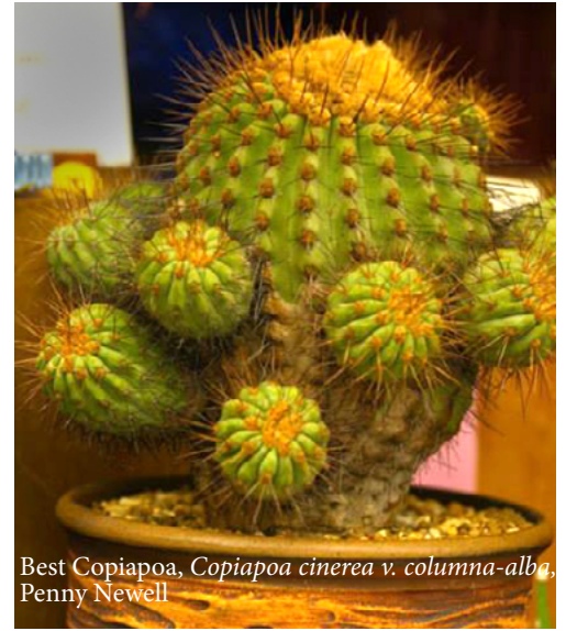
Best Copiapoa, Copiapoa cinerea v. columna-alba , Penny Newell