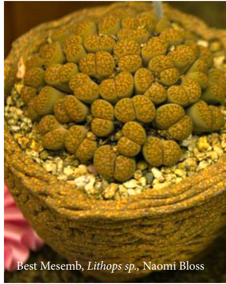
Best Mesemb, Lithops sp. , Naomi Bloss