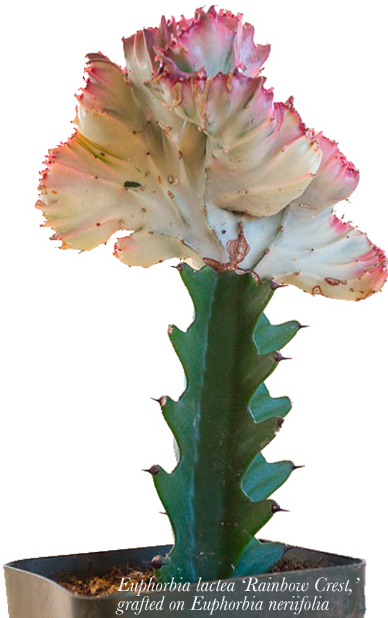
Euphorbia lactea 'Rainbow Crest', grafted on Euphorbia nerifolia