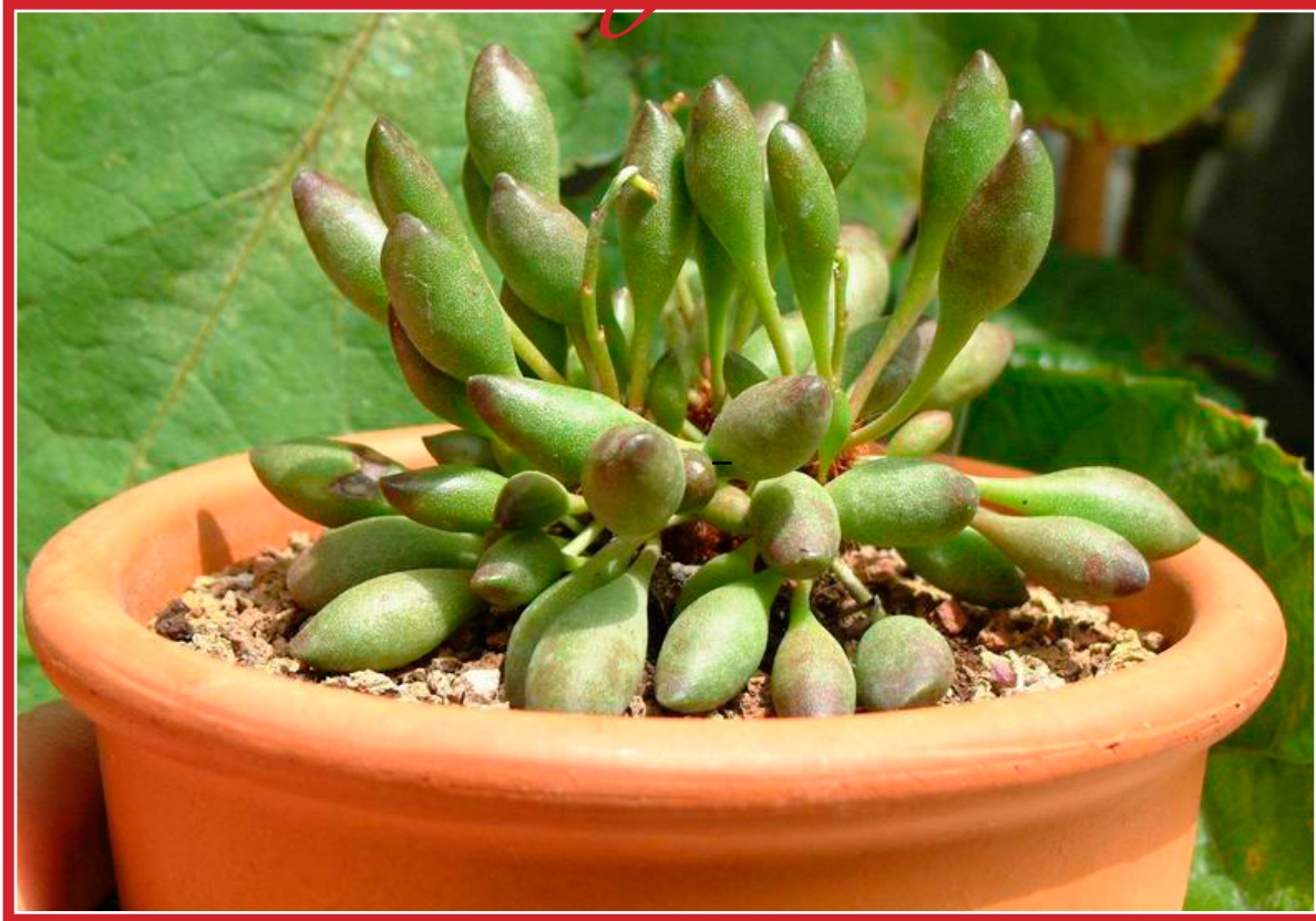
Adromischus cristatus v. clavifolius