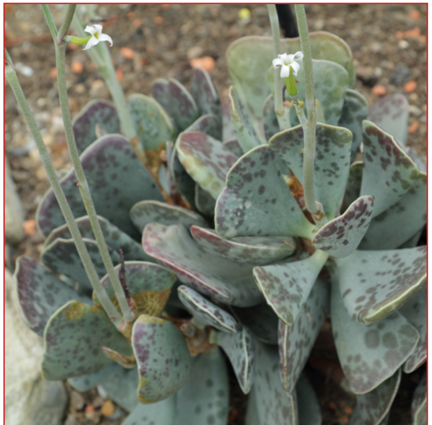
Adromischus triflorus