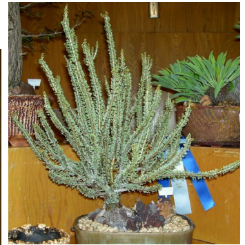
BEST SUCCULENT OPEN Ceraria namaquensis (Naomi Bloss)