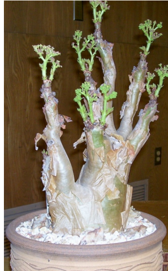
BEST SUCCULENT ADVANCED Cyphostemma uter (Penny Newell)