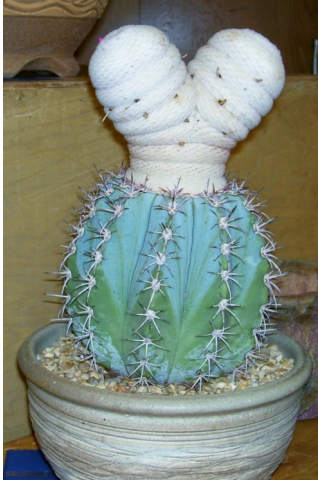
BEST CACTUS ADVANCED Melocactus glaucescens (Penny Newell)