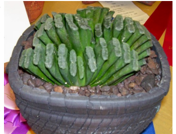
BEST HAWORTHIA Haworthia truncata