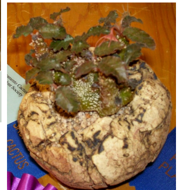
BEST MINIATURE SUCCULENT Dorstenia species (Penny Newell)