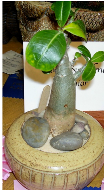
BEST SUCCULENT JUNIOR Adenium hybrid (JJ Dickey)