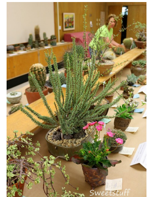
PENNY NEWELL – STAGING