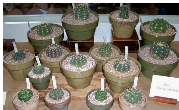
BEST CACTUS COLLECTION Gymnocalycium (Mara Aditajs)