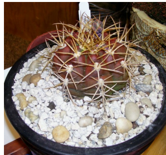
BEST CACTUS JUNIOR Gymnocalycium chiquitanum (JJ Dickey)