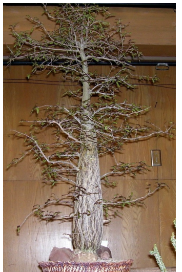
BEST MADAGASCAN SUCCULENT Operculicarya decaryi (Naomi Bloss)