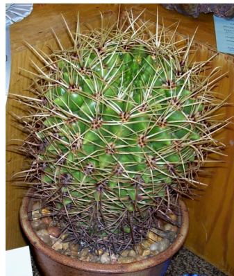
BEST GYMNOCALYCIUM Gymnocalycium monvillei (Marilynn Vilas)