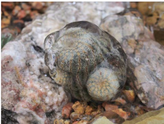
An Echinocereus from our garden encased in ice