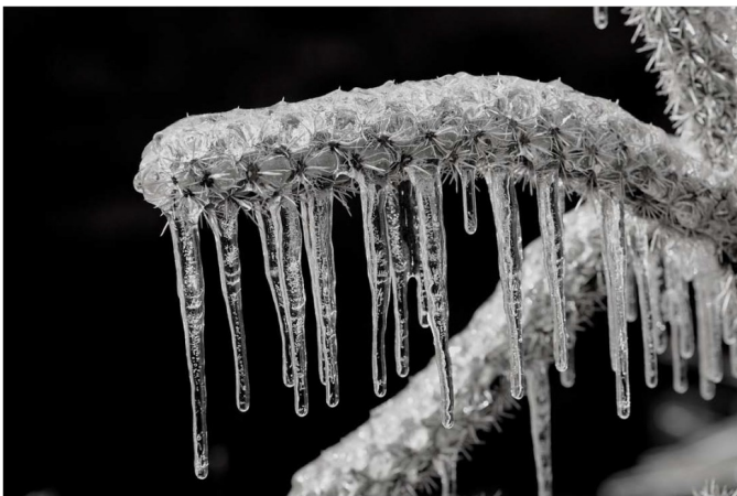
A cholla ( Opuntia spinosior ) joint covered in ice.