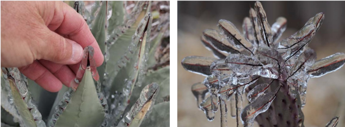
Upper left: Icy Agave, Upper right: an Opuntia pad.

"Here are some photos Mike Douglas (her husband) took after our last ice storm in mid December. Ice is a pain but it sure changes the landscape and the plants, providing many photo opportunities. The photos were taken in our backyard and front garden."