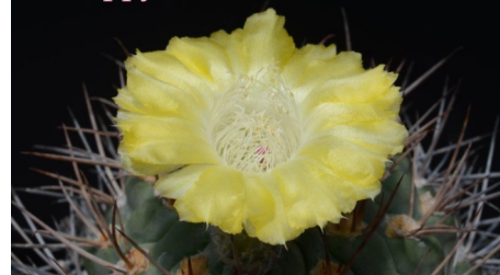
Acanthocalycium minuta