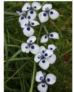
Moreae aristata Endemic to the city of Cape Town