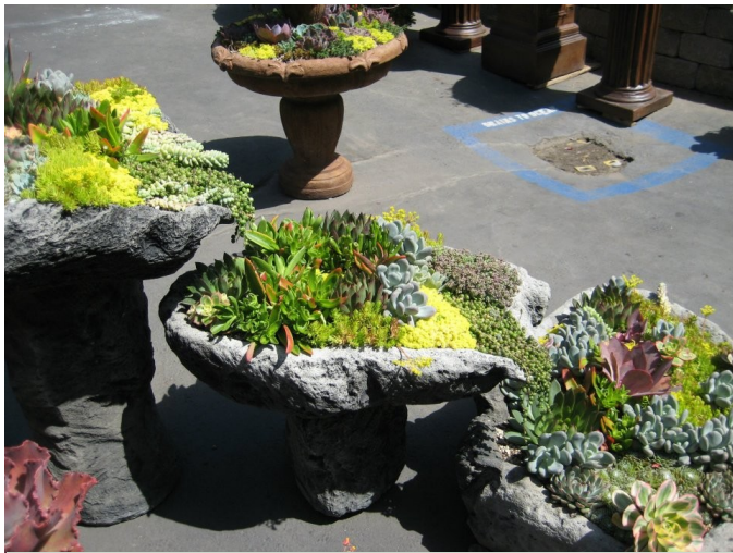
Succulents used in a tiered arrangement for a 'waterfall effect'