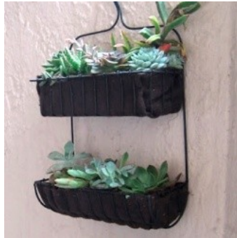
Re-purposed IKEA kitchen rack