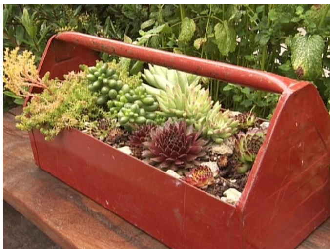
Another old tool box, but painted to match some of the red in the plants.

Surprisingly, non-draining containers---like this repurposed pan---are fine for succulents. They do need more careful watering than those in a typical pot, however. Water that pools can cause roots to rot, so err on the dry side. Succulents tolerate this (being under-watered) better than other types of plants, because succulents draw on moisture stored in fleshy leaves and stems. Keep soil no wetter than a wrung-out sponge, and don't leave a non-draining container where rain or automatic irrigation will drench it. Keep the non-draining containers separate from those that do drain, to avoid accidental overwatering. (Tips & ideas courtesy Debra Lee Baldwin)