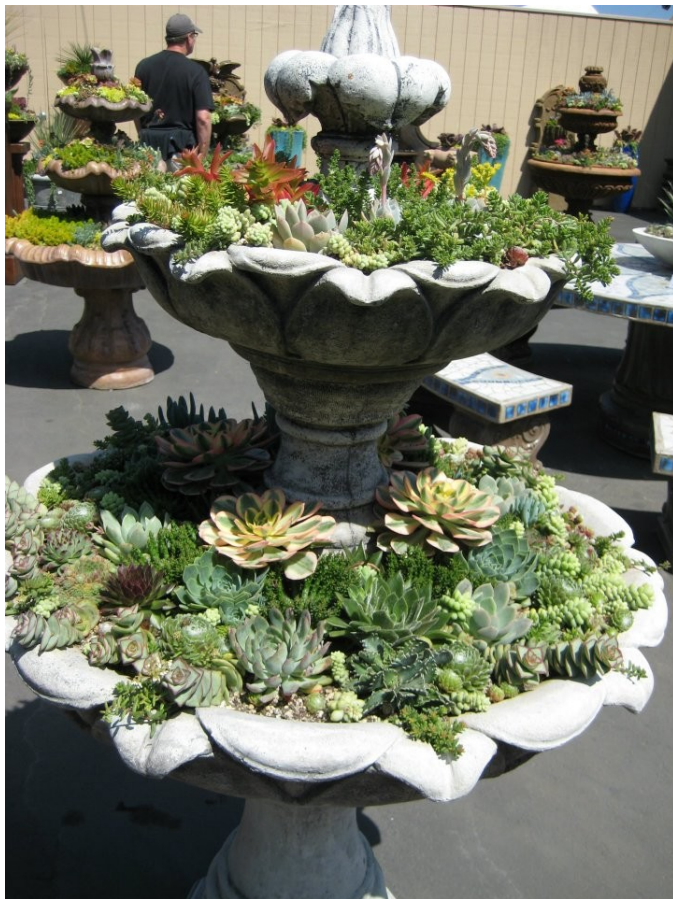
Fountains planted with succulents Anyone have an old unused fountain? Great planter idea!!