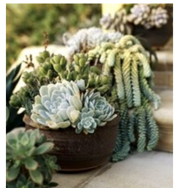
Succulent container gardens are low maintenance and take up little space, perfect for the busy urban gardener.

WATER — Succulents should be watered more frequently in the summer than the winter. The potting mix should be allowed to dry between waterings. During the winter cut watering back to once every other month. Overwatering is the single most common cause of plant failure. A succulent should never be allowed to sit in water.