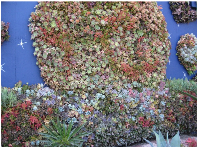
Closer look at the number of succulents needed to make this large vertical succulent display. Can anyone guess how many succulents there really are?