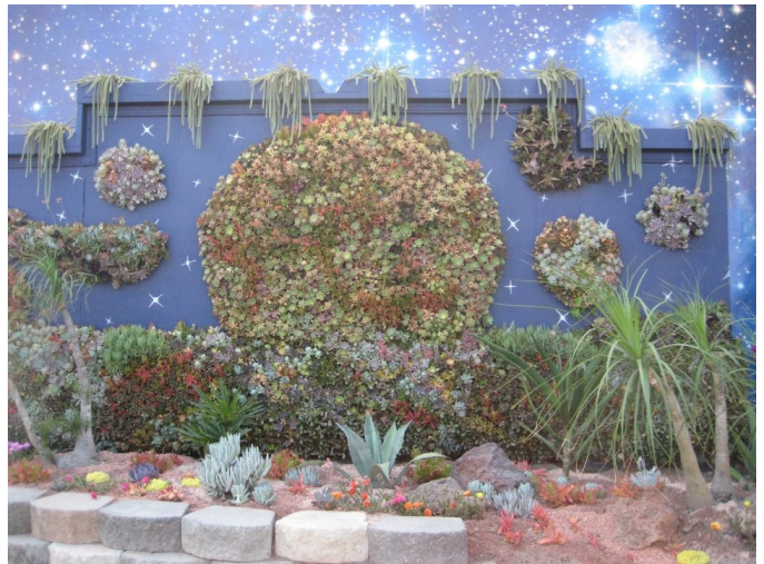
Vertical Succulent Display at the 2012 San Diego County Fair...theme was "Out of This World"