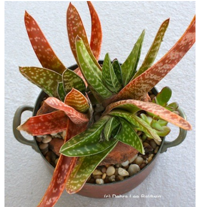
Re-purposed cooking pan to a succulent planter.

Surprisingly, non-draining containers---like this repurposed pan---are fine for succulents. They do need more careful watering than those in a typical pot, however. Water that pools can cause roots to rot, so err on the dry side. Succulents tolerate this (being under-watered) better than other types of plants, because succulents draw on moisture stored in fleshy leaves and stems. Keep soil no wetter than a wrung-out sponge, and don't leave a non-draining container where rain or automatic irrigation will drench it. Keep the non-draining containers separate from those that do drain, to avoid accidental overwatering. (Tips & ideas courtesy Debra Lee Baldwin)