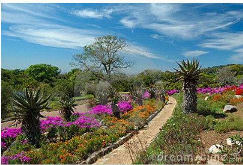
Kirstenbosch Botanical Gardens (Table Mountain, Cape Town)