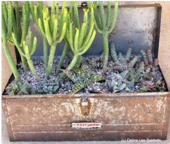
Old & rusted Craftsman Tool Box