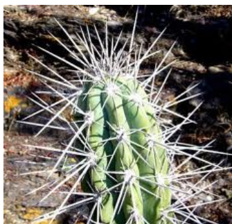
Stetsonia coryne (“Toothpick cactus”)