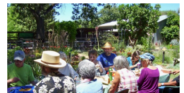
Lunching at the Brugas

Down the dirt Creekside Road outside of Davis to our next stop where everyone broke out lunch on picnic tables