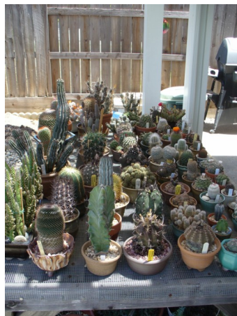
Avery’s plant shelf table

At the Shepard Garden & Arts Center meet and greet included 3 new members (2 more met us later). Car-sharing was arranged and we set off to the Avery collection. George and Oksun use their small outdoor space to the max, thanks to the greenhouse George assembled and Oksun’s organization. An almost unbelievable number of beautiful plants are set on 2 long two-shelf tables under a