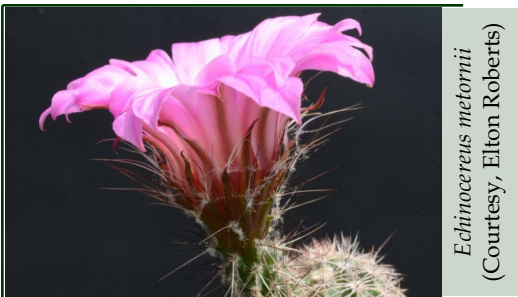
Echinocereus metornii