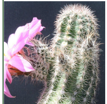
Echinocereus metornii